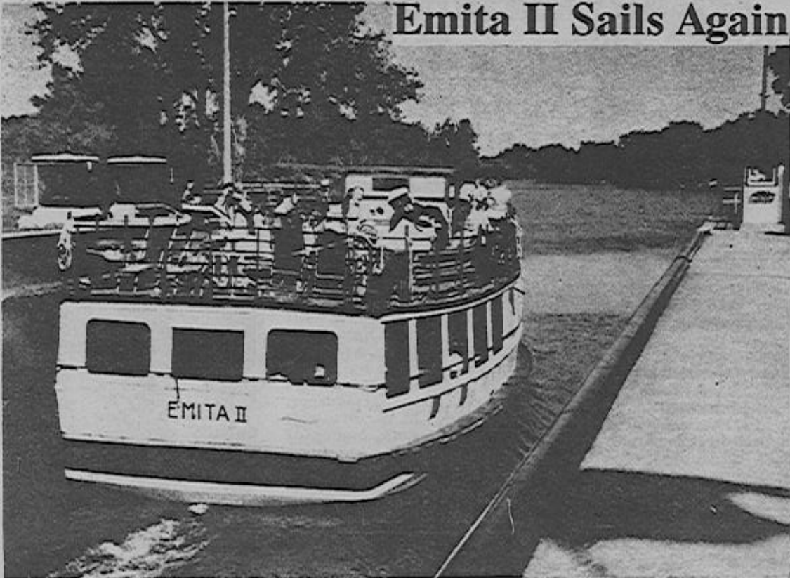
The Emita II, With Brethren and friends aboard, heads for open water after leaving the Lock at Clover Street.